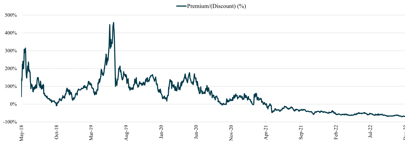
ETCG Premium/(Discount): ETCG Share Price vs. Digital Asset Holdings per Share (%)

The following chart sets out the historical premium and discount for the Shares as reported by OTCQX and the Trust's Digital Asset Holdings per Share.