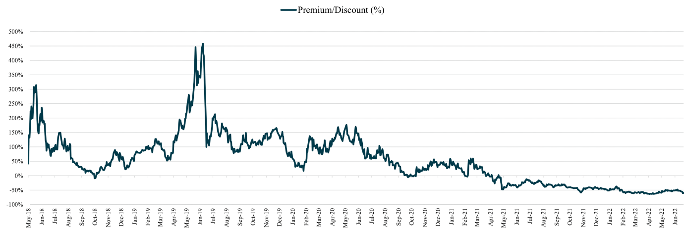
ETCG Premium/(Discount): ETCG Share Price vs. Digital Asset Holdings per Share (%)

The following chart sets out the historical premium and discount for the Shares as reported by OTCQX and the Trust’s Digital Asset Holdings per Share.