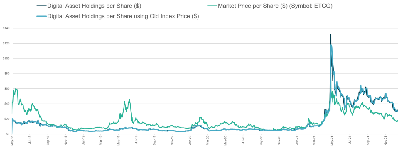
ETCG Premium/(Discount): ETCG Share Price vs. Digital Asset Holdings per Share ($)

The following chart sets out the historical premium and discount for the Shares as reported by OTCQX and the Trust's Digital Asset Holdings per Share based on the Index Price and the Old Index Price.