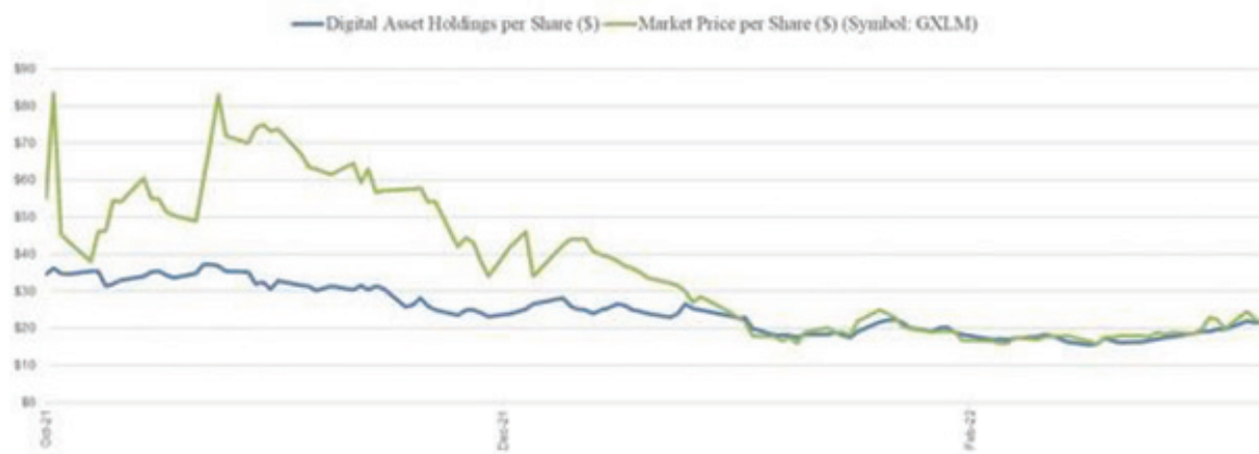
GXLM Premium/(Discount): GXLM Share Price vs. Digital Asset Holdings per Share ($)

The following chart sets out the historical closing prices for the Shares as reported by OTCQX and the Trust's Digital Asset Holdings per Share.