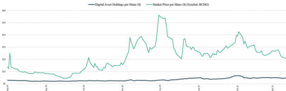
BCHG Premium: BCHG Share Price vs. Digital Asset Holdings per Share ($)

The following chart sets out the historical premium and discount for the Shares as reported by OTCQX and the Trust's Digital Asset Holdings per Share.