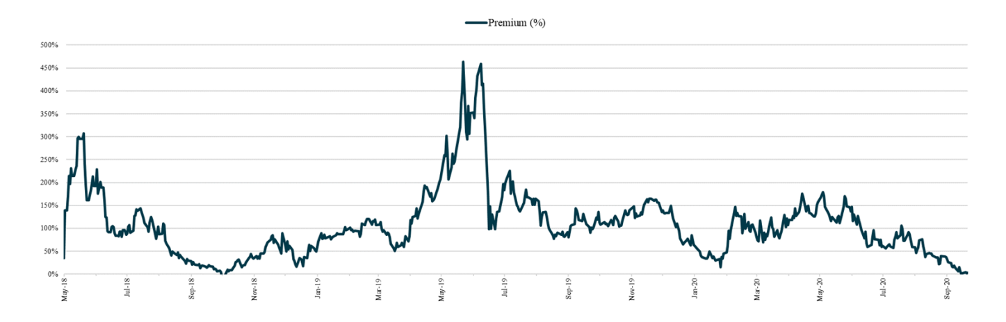
ETCG Premium: ETCG Share Price vs. Digital Asset Holdings per Share (%)

The following chart sets out the historical premium and discount for the Shares as reported by OTCQX and the Trust's Digital Asset Holdings per Share.