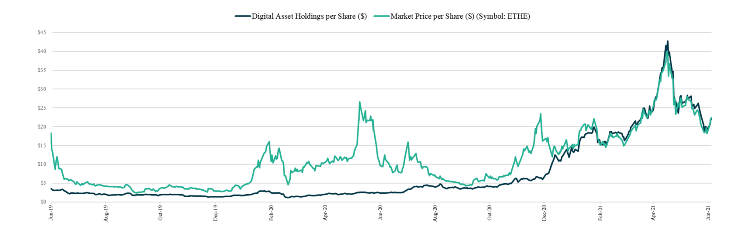
ETHE Premium/(Discount): ETHE Share Price vs. Digital Asset Holdings per Share ($)

The following chart sets out the historical closing prices for the Shares as reported by OTCQX and the Trust's Digital Asset Holdings per Share.